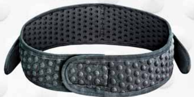
Lumbar Support Belt

For further product and sales information, contact sales@nexuseu.com or visit our website at www.nexuseu.com Alternatively phone +44 (0) 1503 230214 or fax +44 (0) 870 4463987