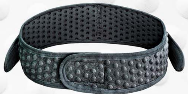
Lumbar Support Belt

For further product and sales information, contact sales@nexuseu.com or visit our website at www.nexuseu.com Alternatively phone +44 (0) 870 0111451 or fax +44 (0) 870 4463987