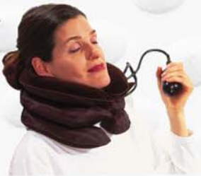
Pneumatic Neck Support and Brace