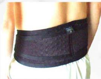
Back and Lumbar Support (SI) Belt

Products may differ slightly from the images shown